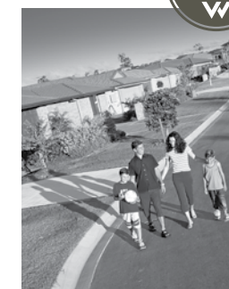
Master planned communities since 1986