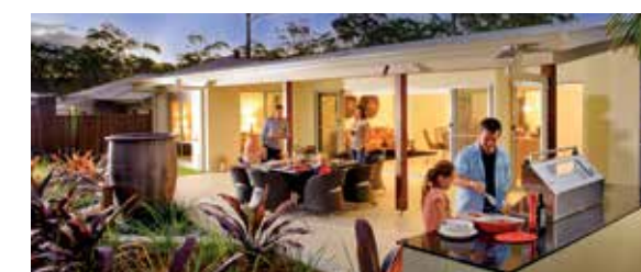
Feel welcome and part of our community

More than 40,000 Australians call a Villa World address, home