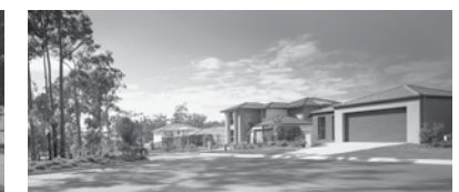
Quality craftsmanship, design innovation and enduring relationships