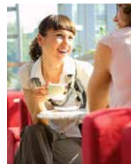
Relax with a day of shopping at Westfield North Lakes

More than 40,000 Australians call a Villa World address, home