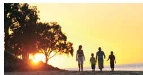
Redcliffe foreshore just 10 minutes from home.