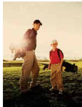
Enjoy a round of golf at North Lakes Golf Club, just minutes from home